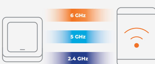
MLO (Multi-Link Operation)

By utilizing multiple bands simultaneously through multi-link operation (MLO), Wi-Fi 7 helps create a more stable and reliable network. Through wireless link redundancy, aggregation and selection, Wi-Fi 7 is more agile and navigates signal interference, obstacles and varying levels of congestion with ease—helping clients enjoy a strong connection.