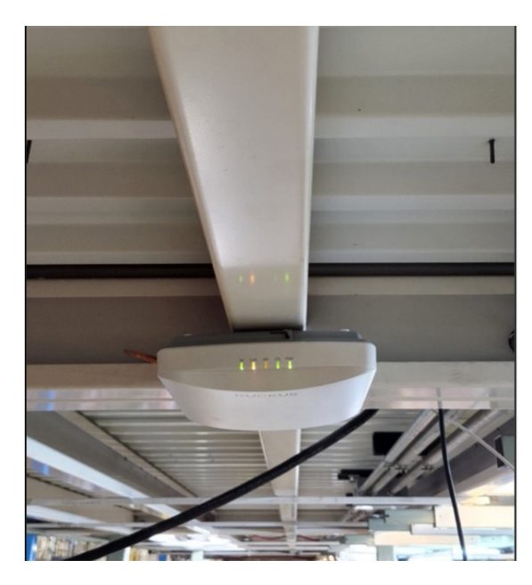
AP mounted under work platform

Metal structures, machinery, and equipment: Metal structures prevalent in MWL facilities, such as steel beams and walls, exacerbate RF challenges. Metals reflect and absorb RF signals, resulting in signal attenuation and distortion. Also, the extensive array of machinery and equipment within MWL facilities pose a significant challenge to RF design. Electromagnetic interference (EMI) generated by these devices can disrupt wireless communication systems, leading to signal degradation and connectivity issues. Overcoming these obstacles requires strategic AP placement and signal boosting technologies.